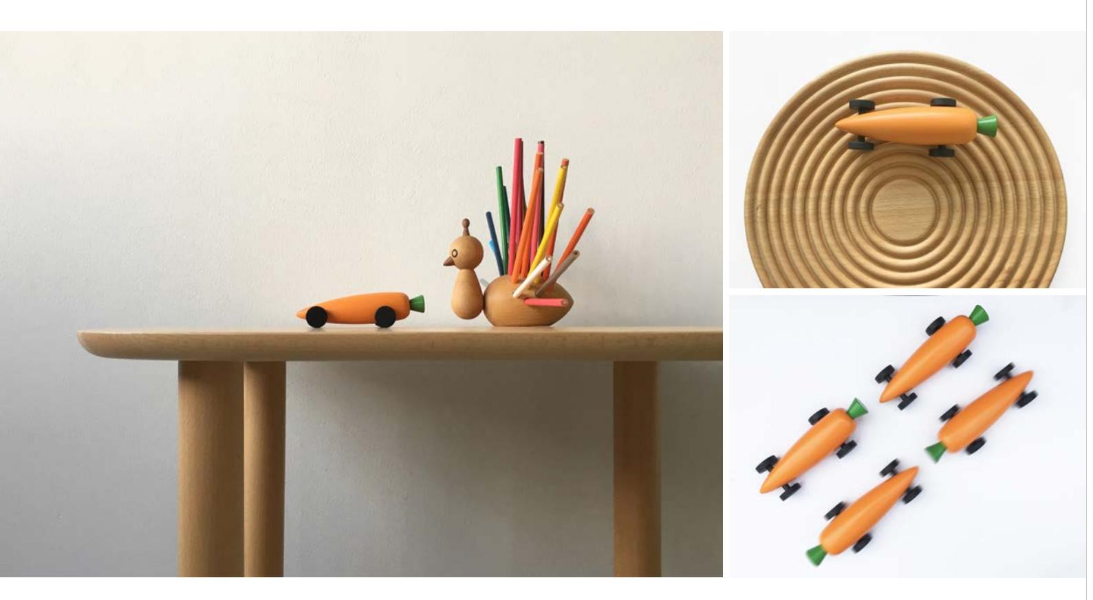
Dimensions: L13.6 x W4.8 x H3.6 cm Fine solid European Beech, powder coated. Material:

Carrot car- a playfull wooden racing car.