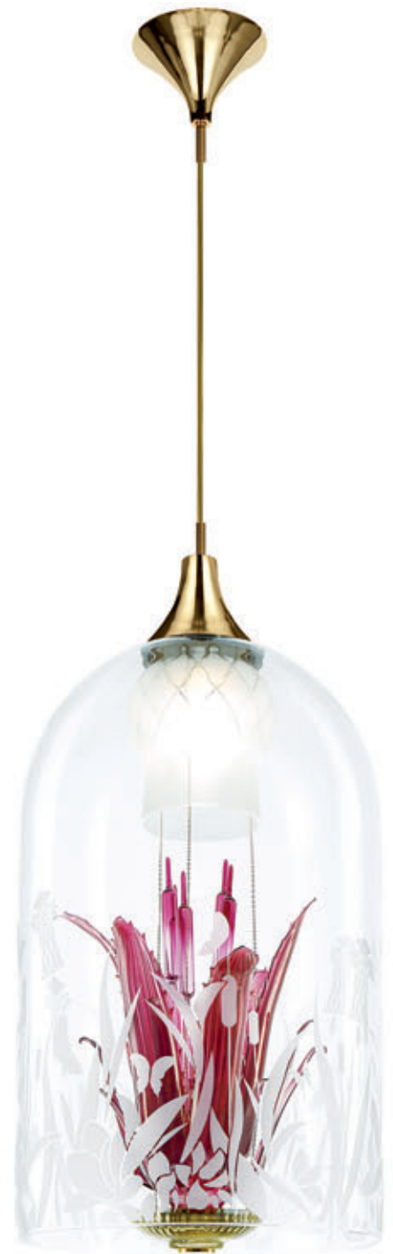
Jardin de Verre Pendant Rivière