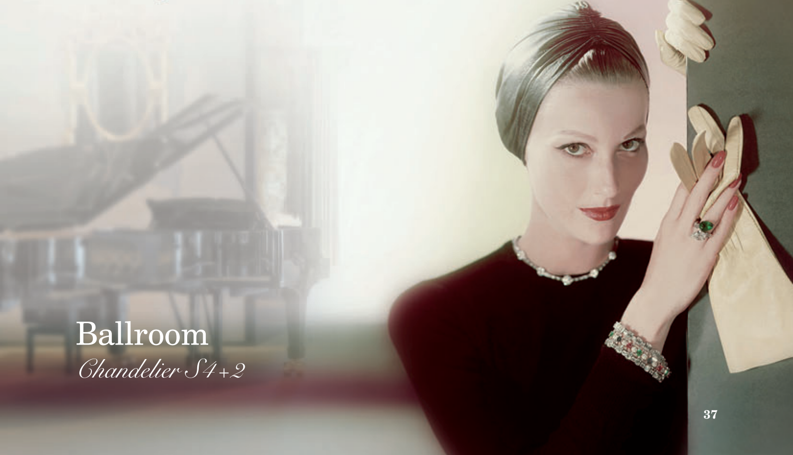
Ballroom Chandelier S4+2