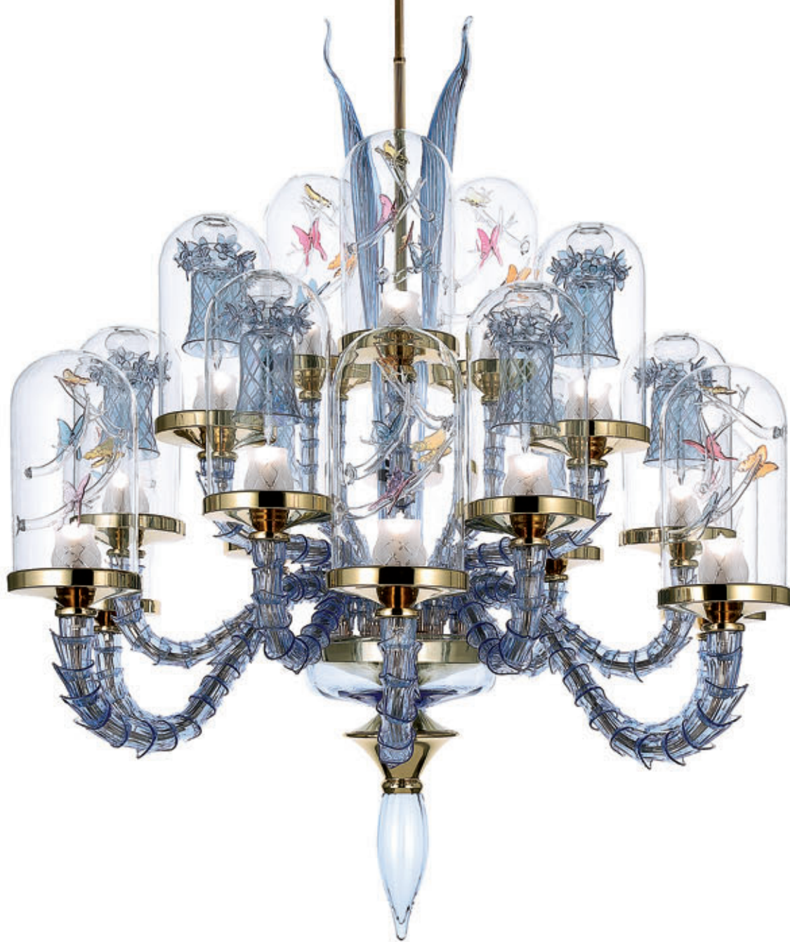
Jardin de Verre Chandelier S18