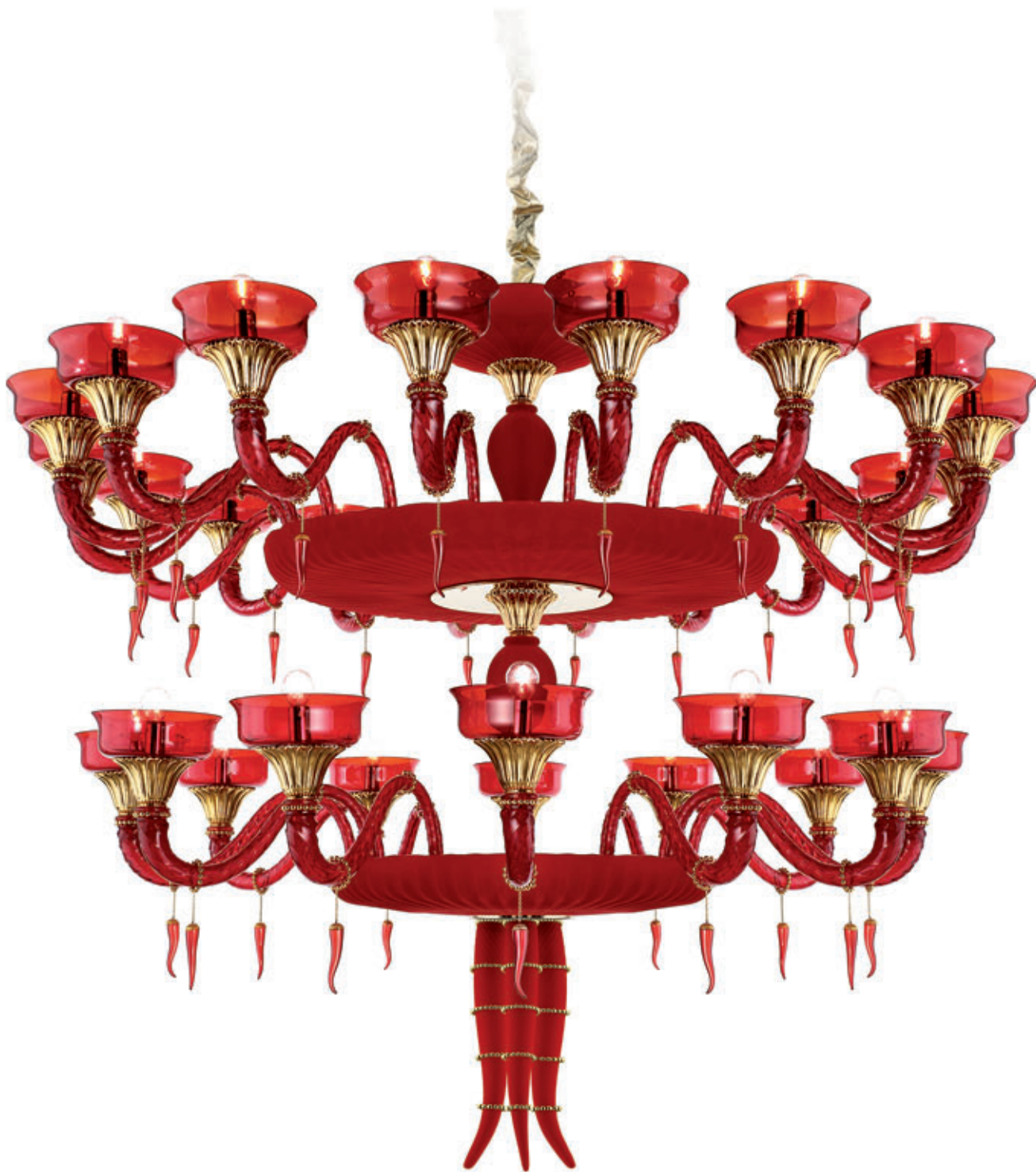
Sicily Chandelier S18+12