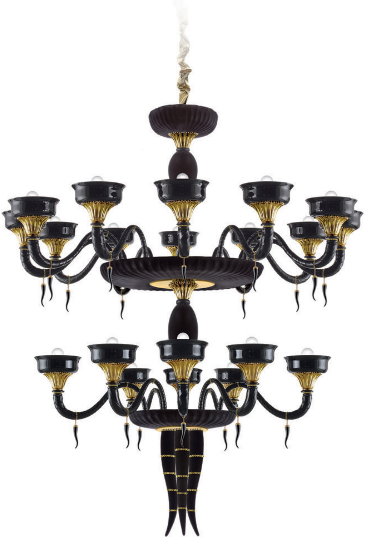
Sicily Chandelier S12+8