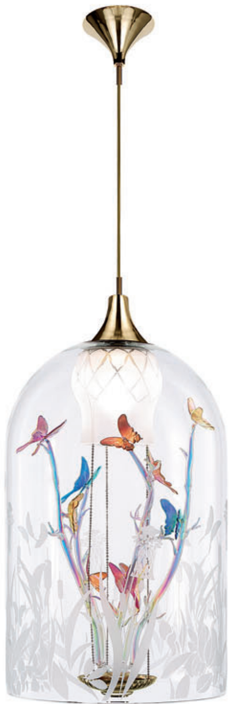
Jardin de Verre Pendant Papillons