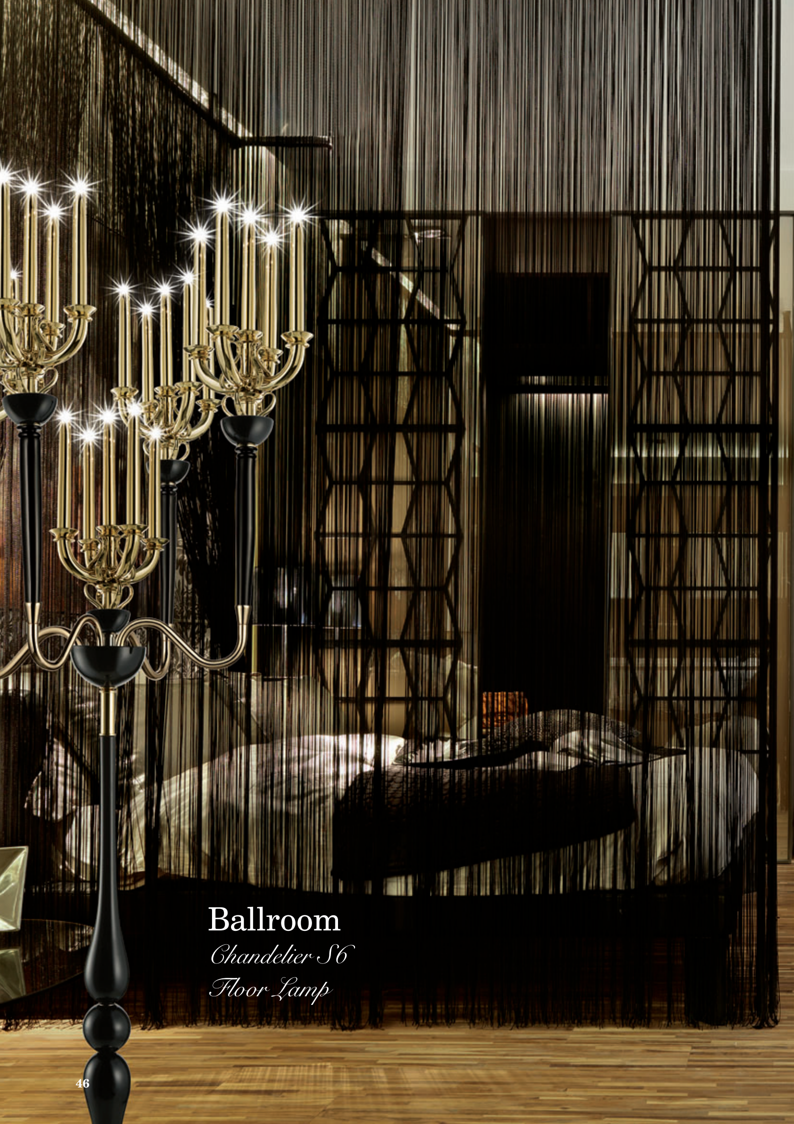
Ballroom Chandelier S6 Floor Lamp