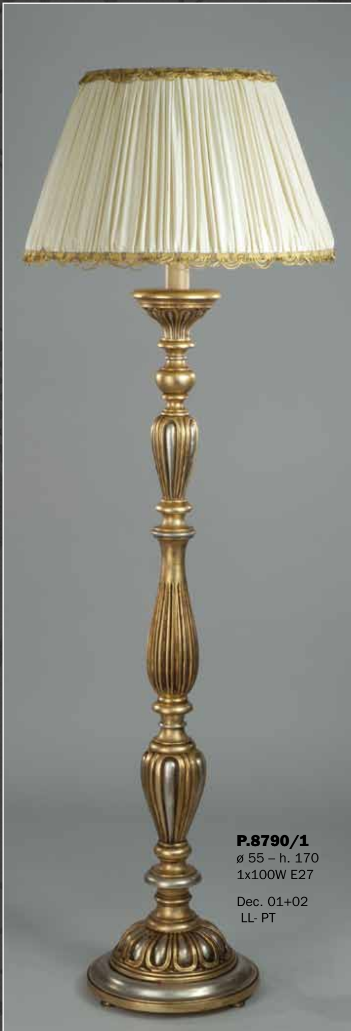
P.8790/1 ø 55 – h. 170 1x100W E27 Dec. 01+02 LL- PT