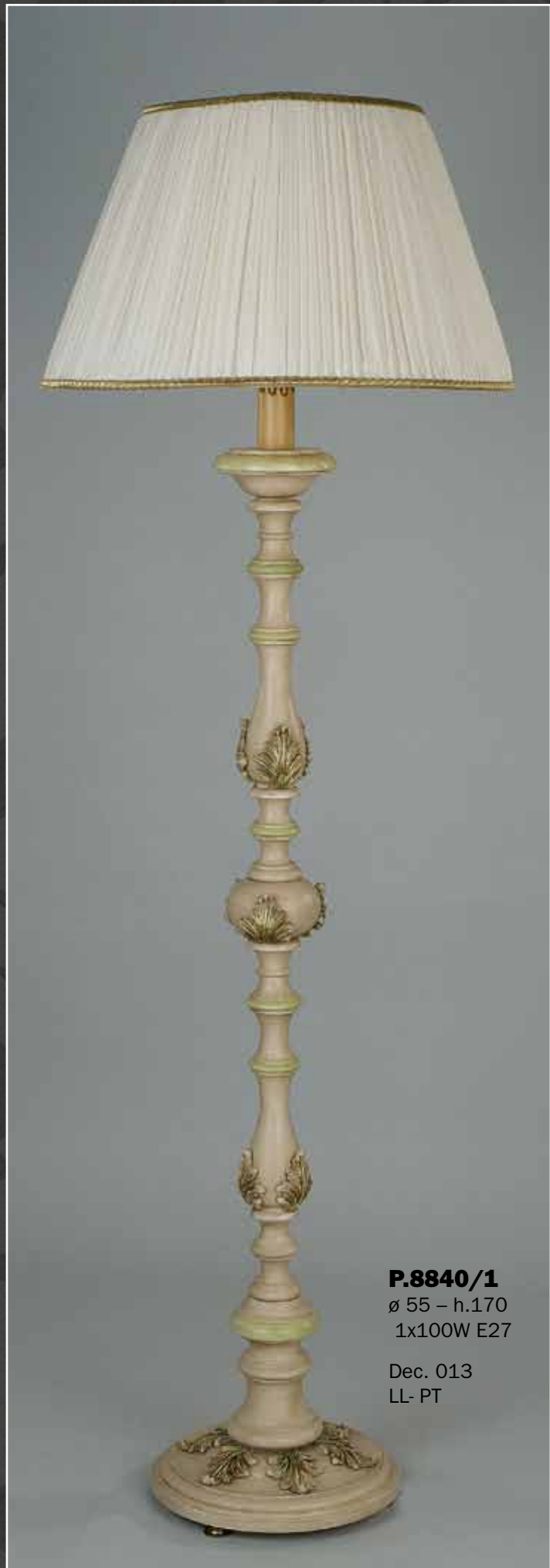
P.8840/1 ø 55 – h.170 1x100W E27 Dec. 013 LL- PT