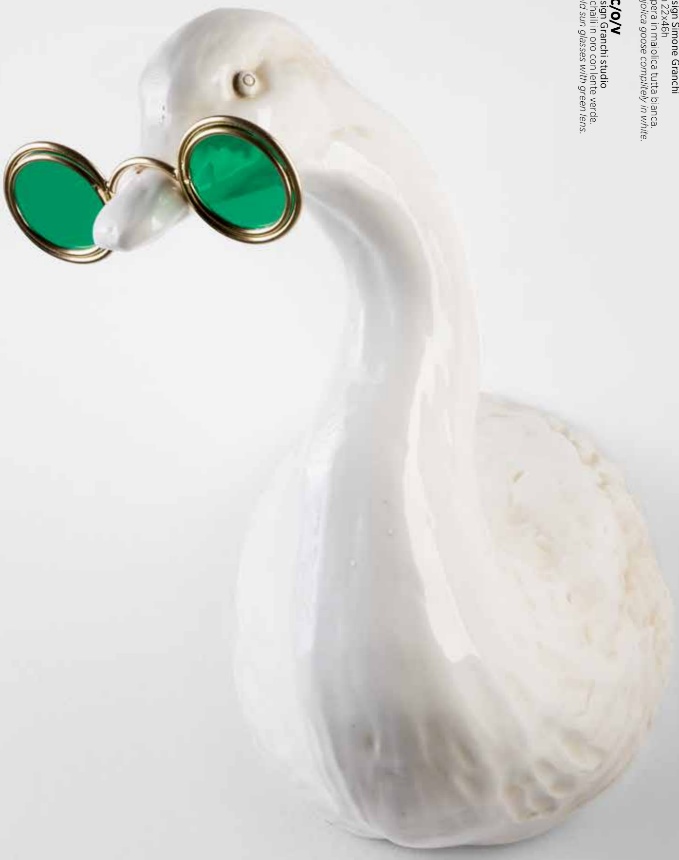
A346 Design Simone Granchi cm 22x46h Pappera in maiolica tutta bianca. Majolica goose completely in white.

CO/O/V Design Granchi studio Occhiali in oro con lente verde. Gold sun glasses with green lens.