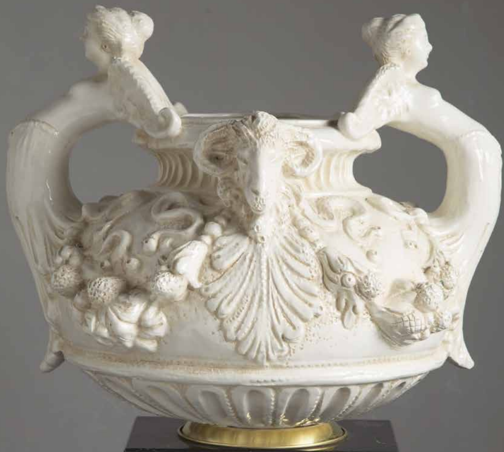
Design Simone Granchi | cm ø47x38x48h | 1xE27 60W | Vaso in maiolica tutto inciso a mano con base in marmo nero marquina e particolare in ottone. Majolica vase all hand-engraved with black marquina marble base and brass detail.