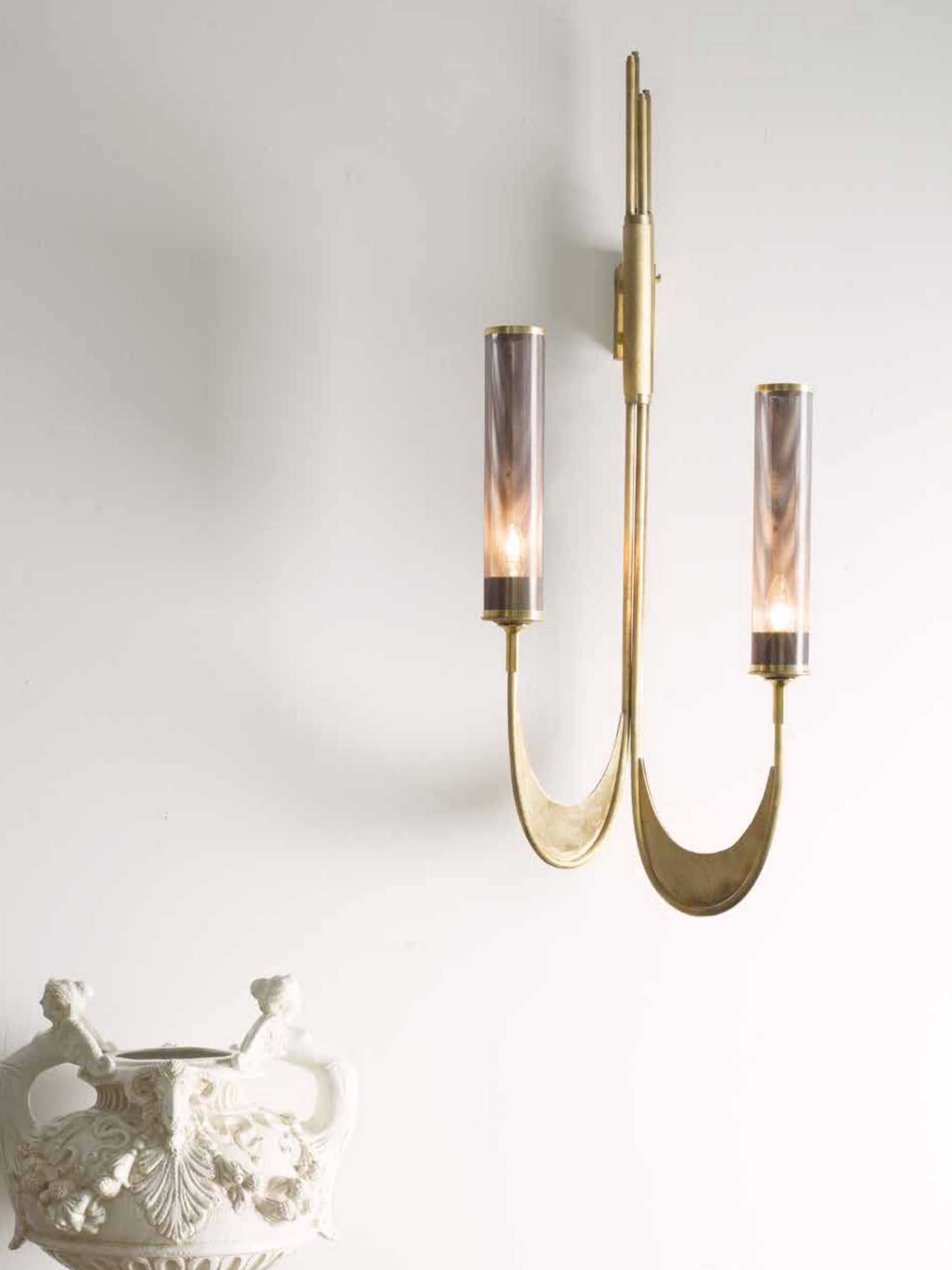
Z632 Design Granchi Studio | cm. ø43x107h | 2xE14 40W | Applique in ottone naturale inciso a mano in effetto seta. I paralumi sono in metallo. Wall lamp all engraved by hand in "Fabric Effect". Natural brass. Lampshade in metal.