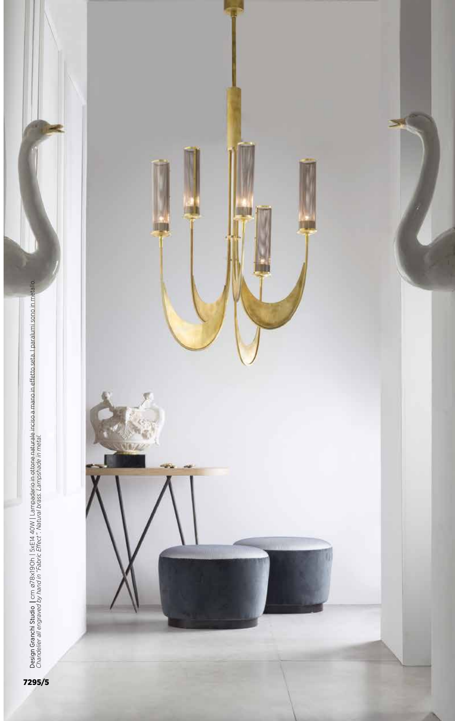
7295/5 Design Granchi Studio | cm. ø78x190h | 5xE14 40W | Lampadario in ottone naturale inciso a mano in effetto seta. I paralumi sono in metallo. Chandelier all engraved by hand in "Fabric Effect". Natural brass. Lampshade in metal.