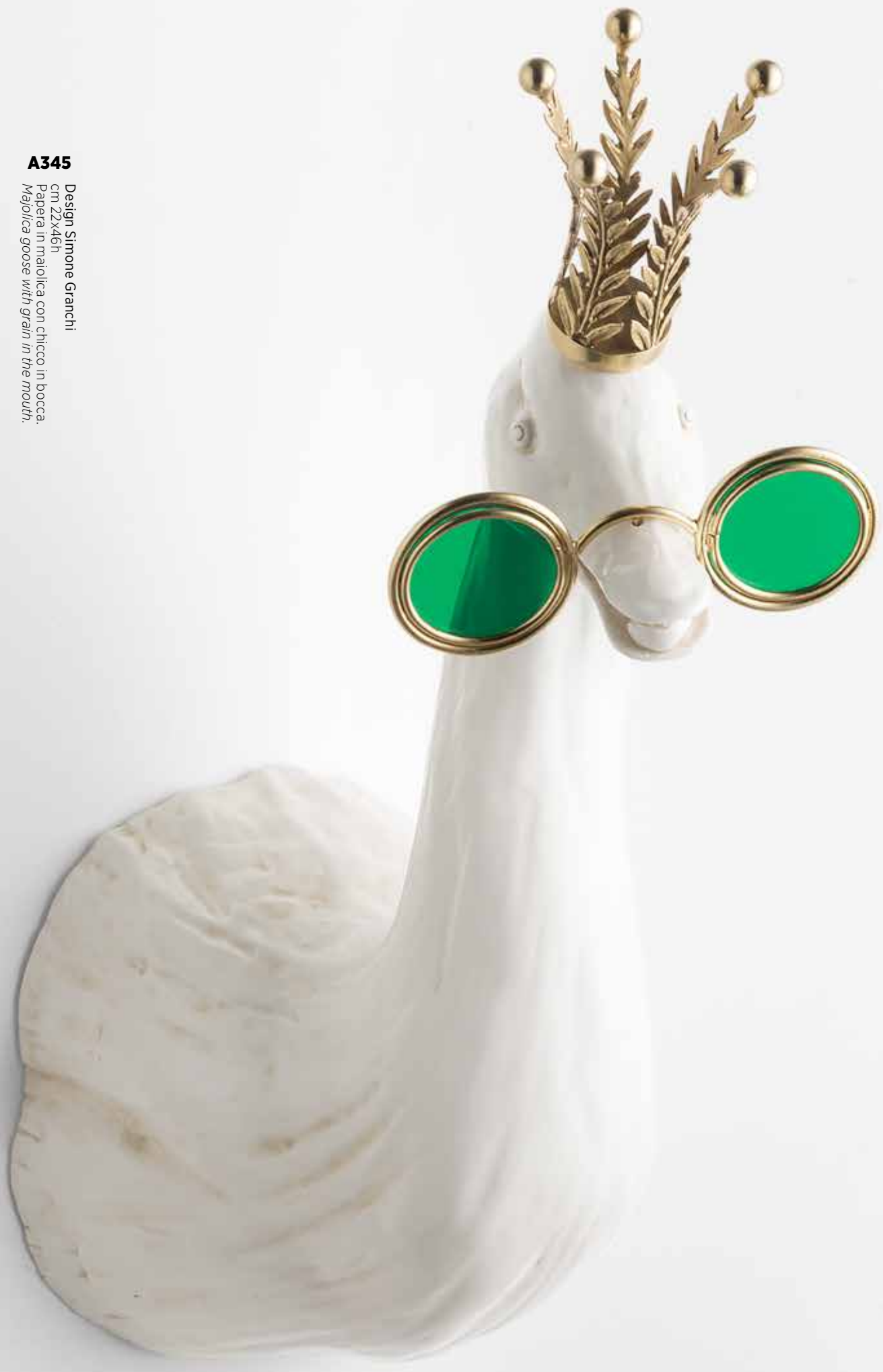
A345 Design Simone Granchi cm 22x46h Pappera in maiolica con chicco in bocca. Majolica goose with grain in the mouth.

CO/RO Design Granchi Studio Corona oro. Gold crown.