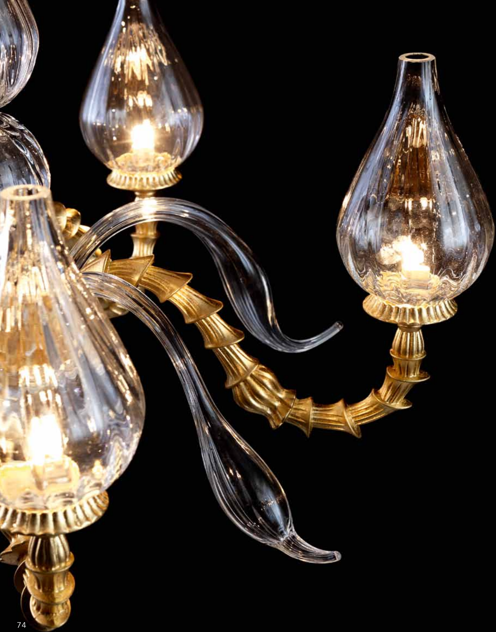
● Art. 20202/15-T Diam.80 cm. - H.140 cm. 15 x G9 33W ES max