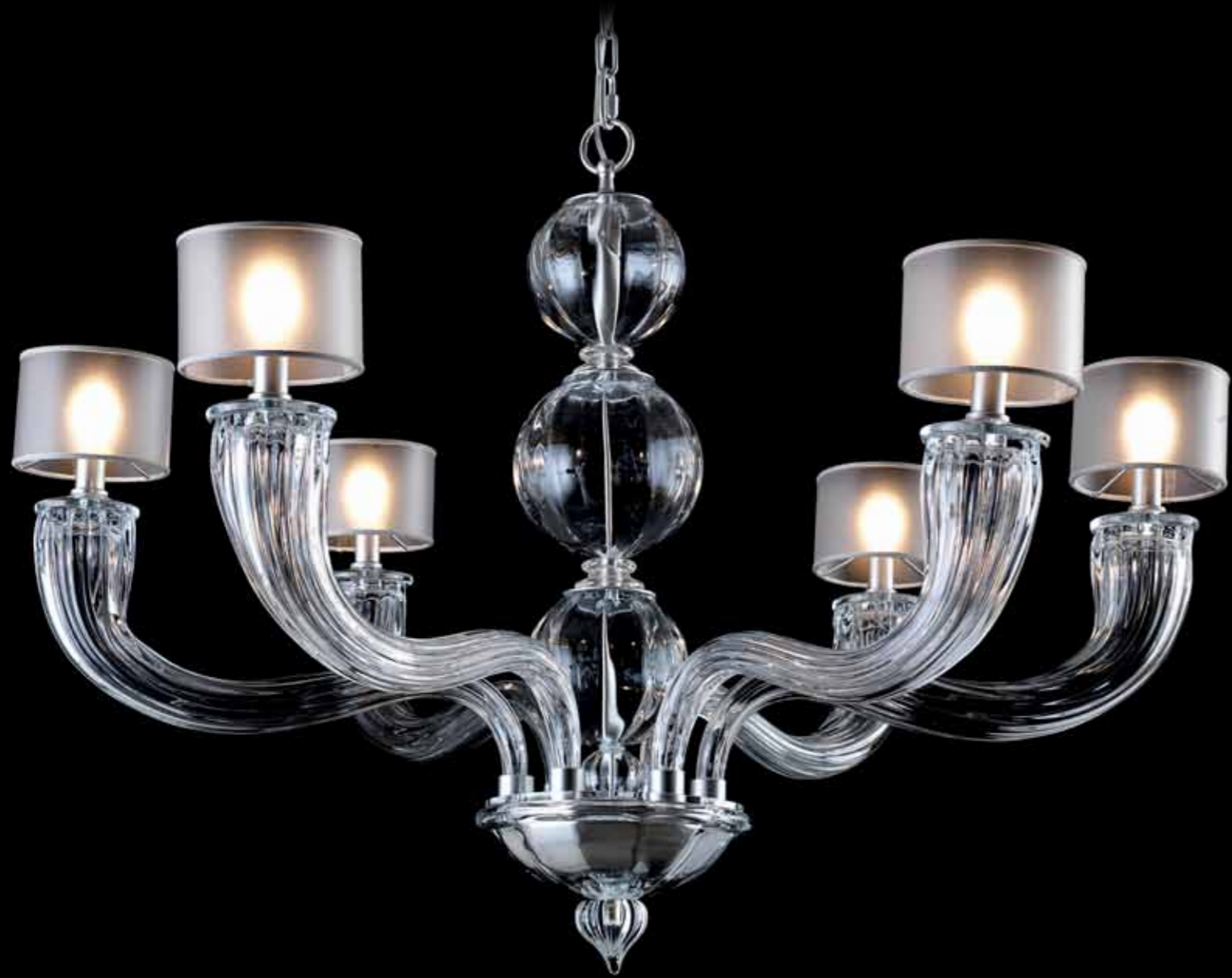
● Art. 18702/6-T Diam.100 cm. - H.75 cm. 6 x G9 33W ES max