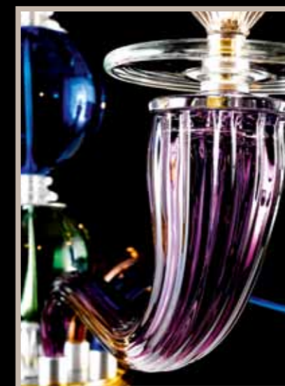
viola / violet