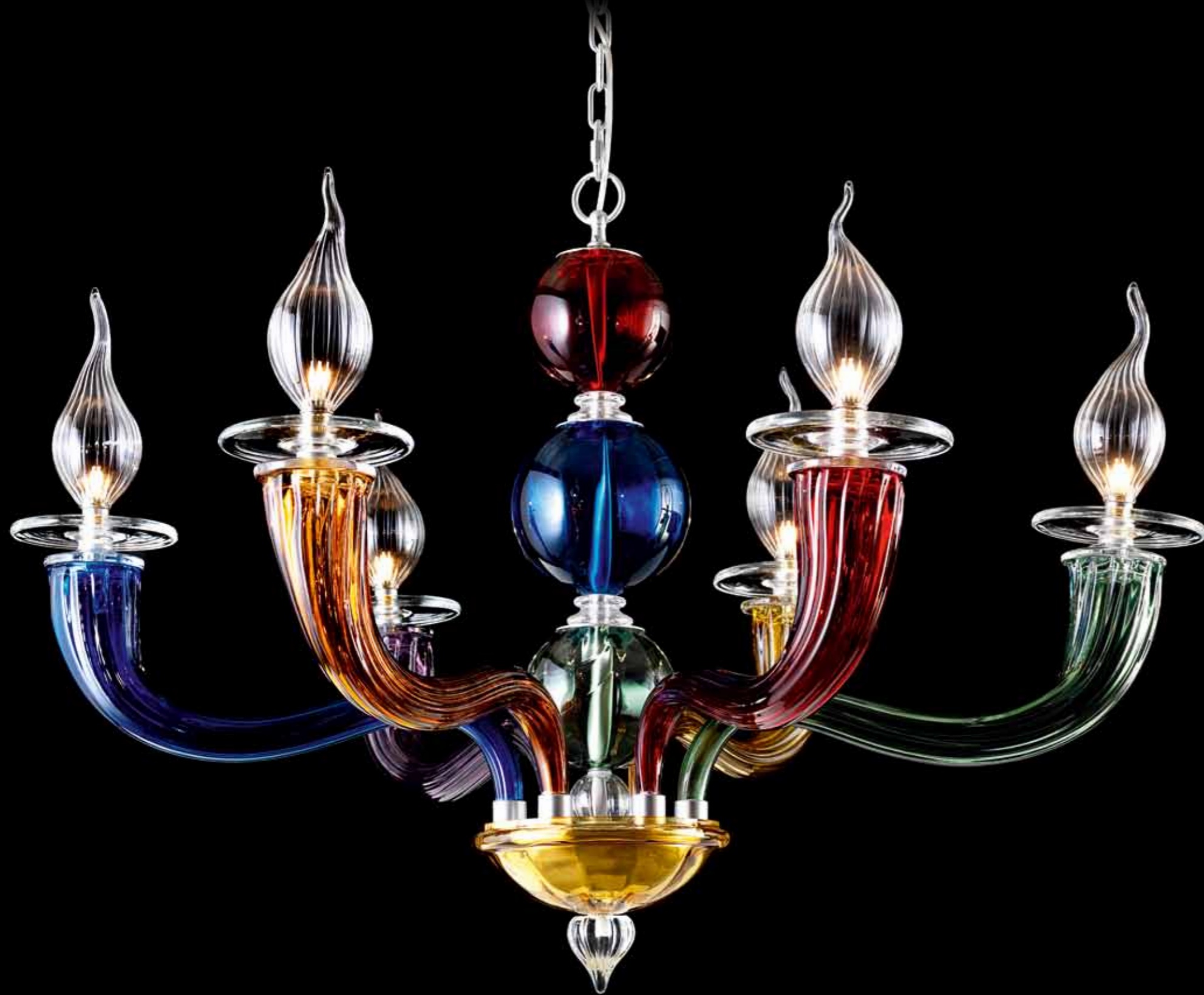
● Art. 18700/6-X Diam.105 cm. - H.75 cm. 6 x G9 33W ES max