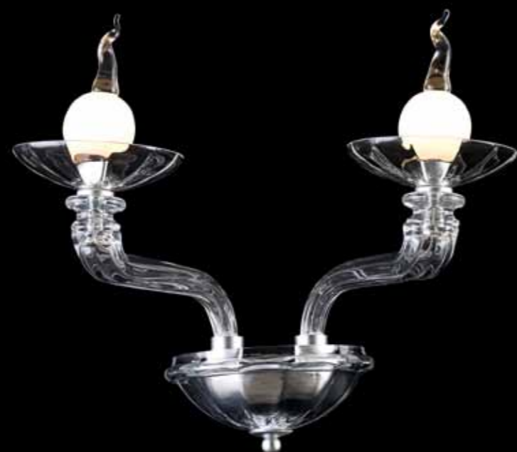
● Art. 18810/A20-T Diam.43 cm. - H.33 cm. - Sp.30 cm. 2 x G9 Led 3,5W max solo lampade LED only LED bulbs