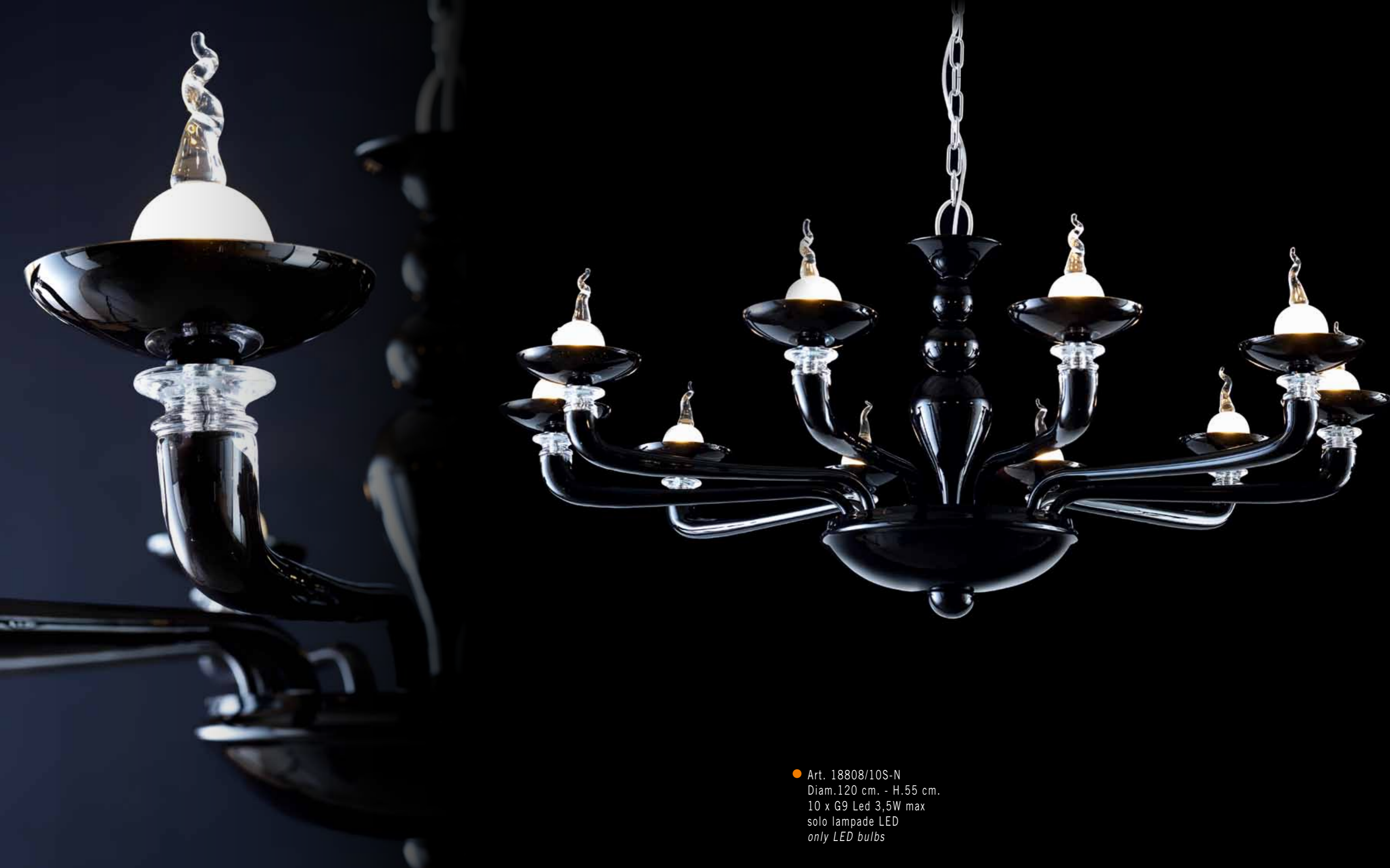
● Art. 18808/10S-N Diam.120 cm. - H.55 cm. 10 x G9 Led 3,5W max solo lampade LED only LED bulbs