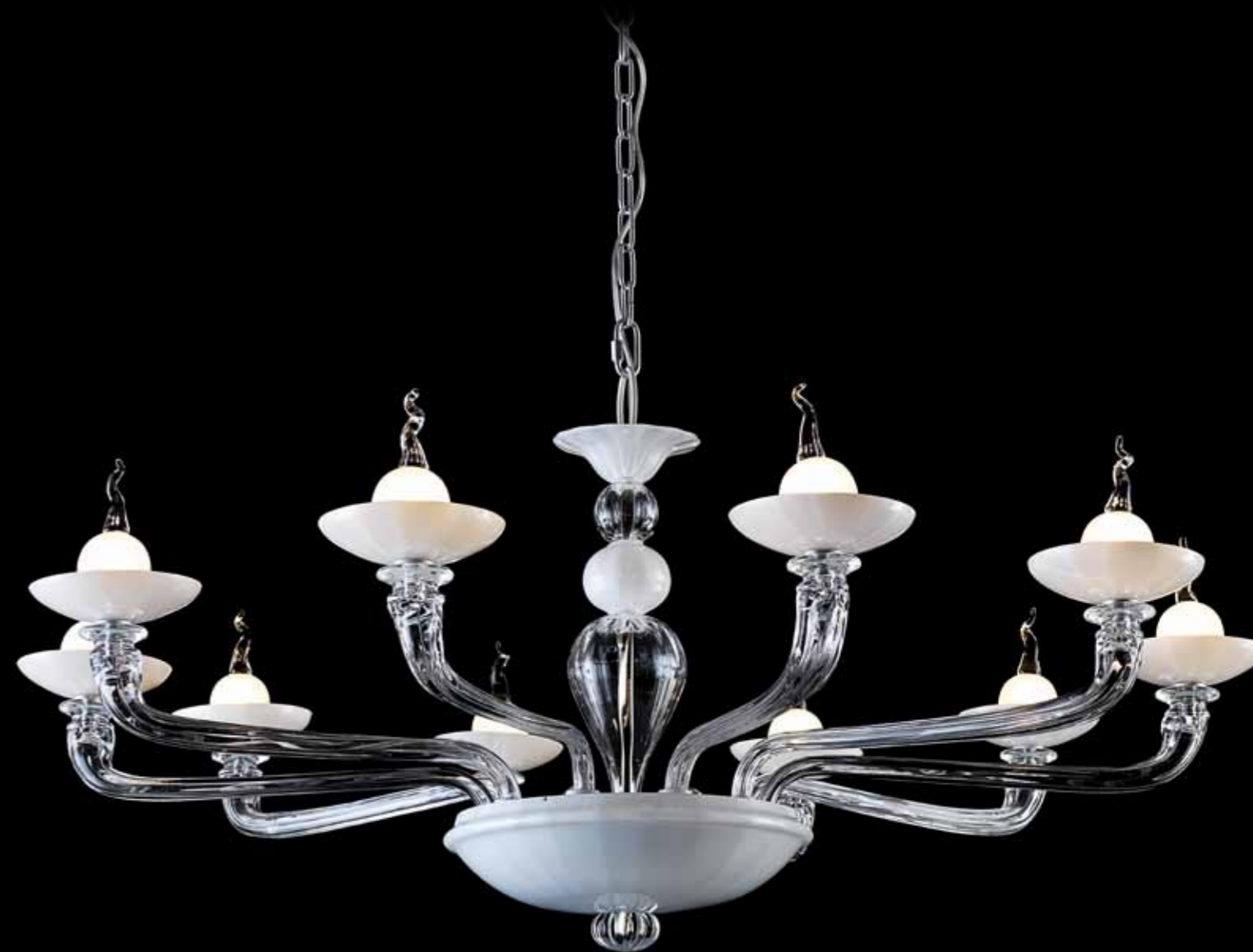
● Art. 18808/100-TW Diam.120 cm. - H.55 cm. 10 x G9 Led 3,5W max solo lampade LED only LED bulbs