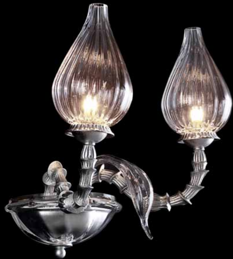
● Art. 20305/A2-T Diam.36 cm. - H.33 cm. - Sp.28 cm. 2 x G9 33W ES max