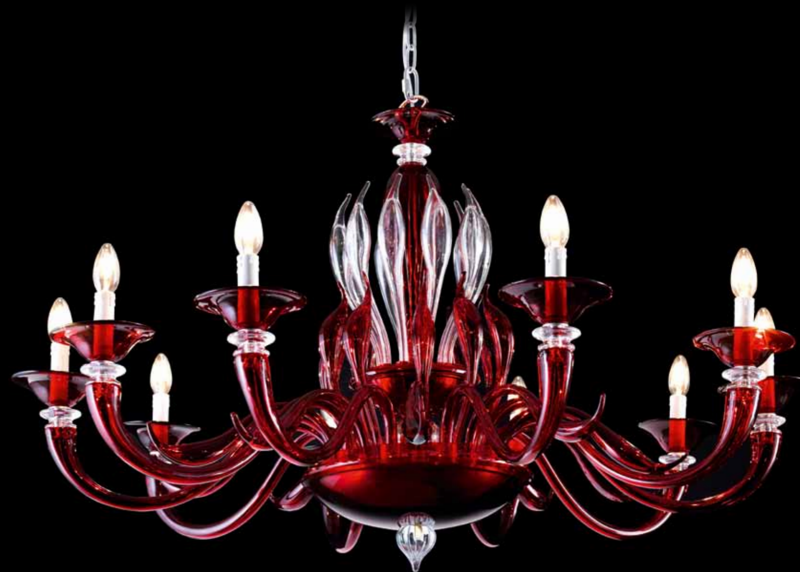
● Art. 18801/10S-R Diam.115 cm. - H.70 cm. 10 x E14 42W ES max