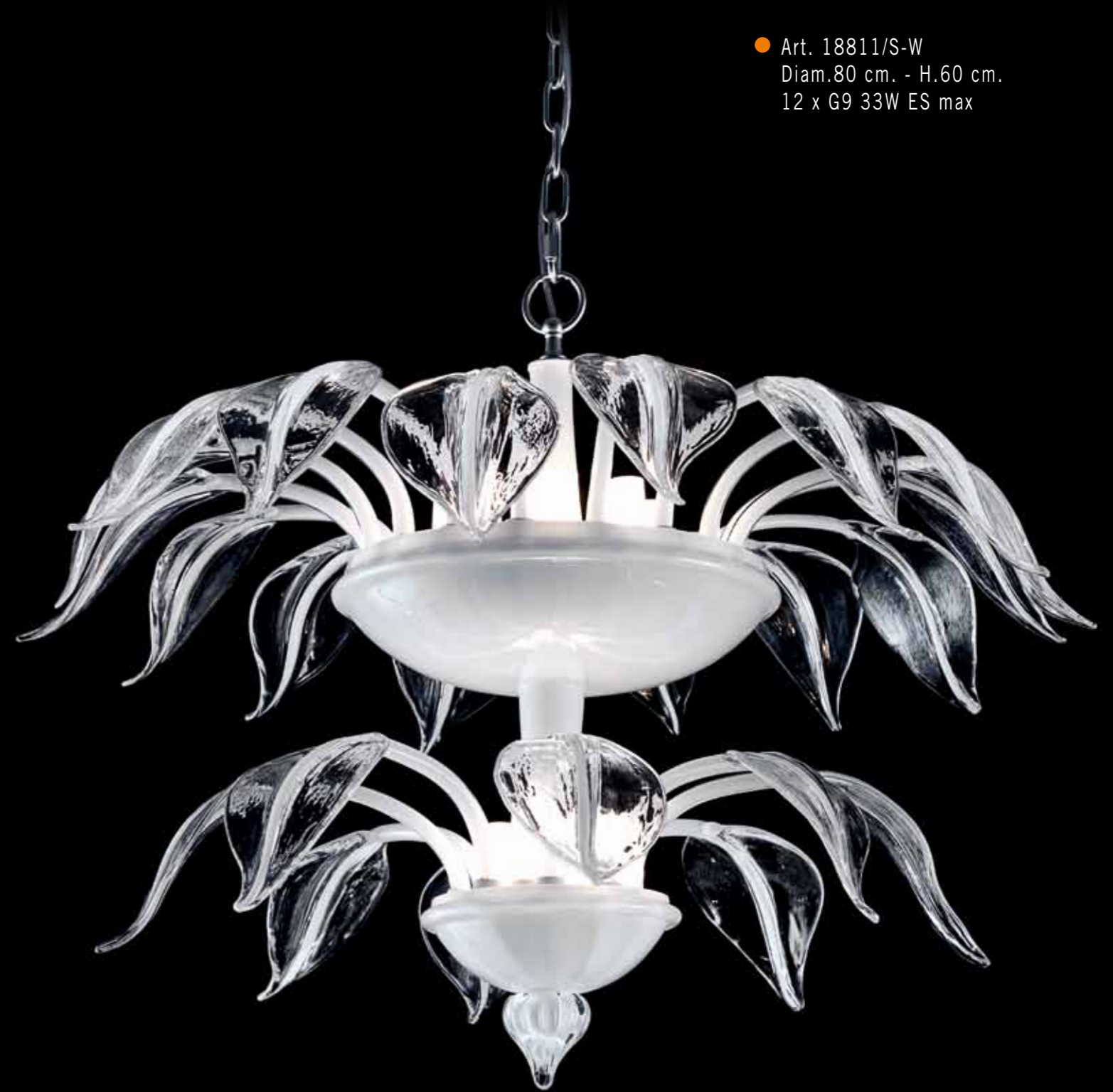
● Art. 18811/S-W Diam.80 cm. - H.60 cm. 12 x G9 33W ES max