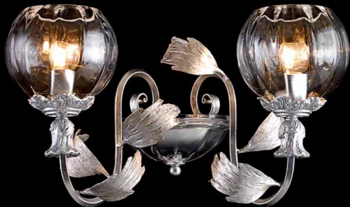
● Art. 19602/A2 Diam.50 cm. - H.30 cm. - Sp.30 cm. 2 x E14 42W ES max