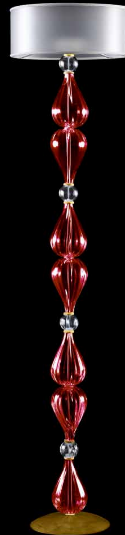
● Art. 20404/P-R Diam. 45 cm. - H. 180 cm. 1xE27 205W ES hal. max