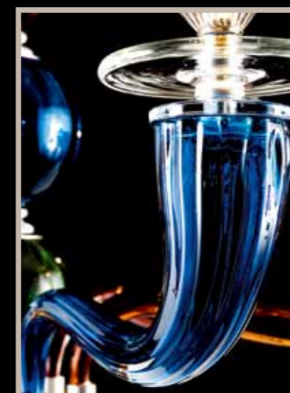
blu / blue