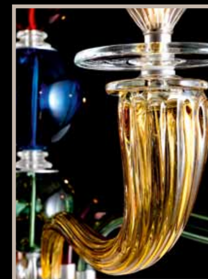
ambra / amber