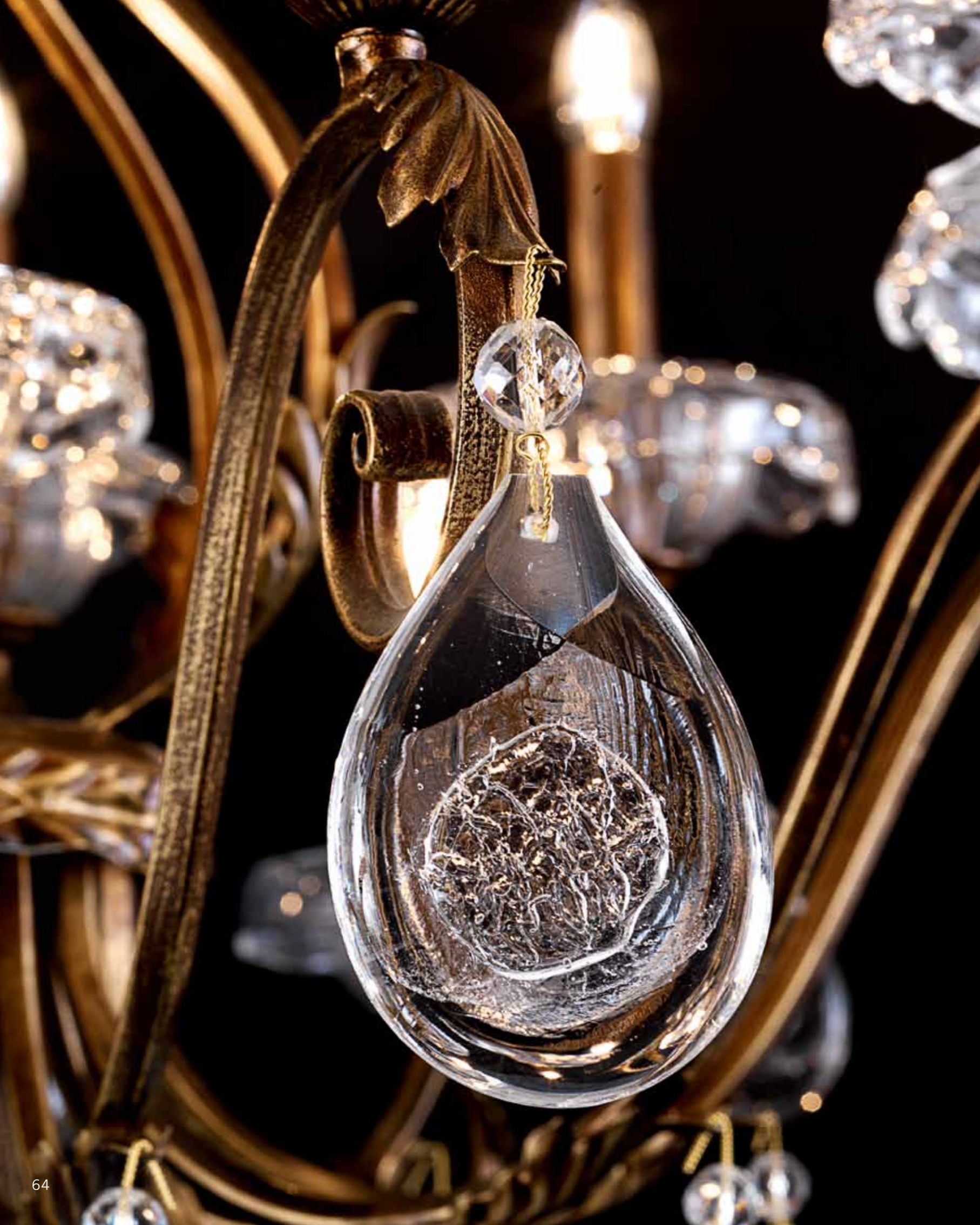
● Art. 20101/18+1 Diam.125 cm. - H.95 cm. 19 x E14 42W ES max