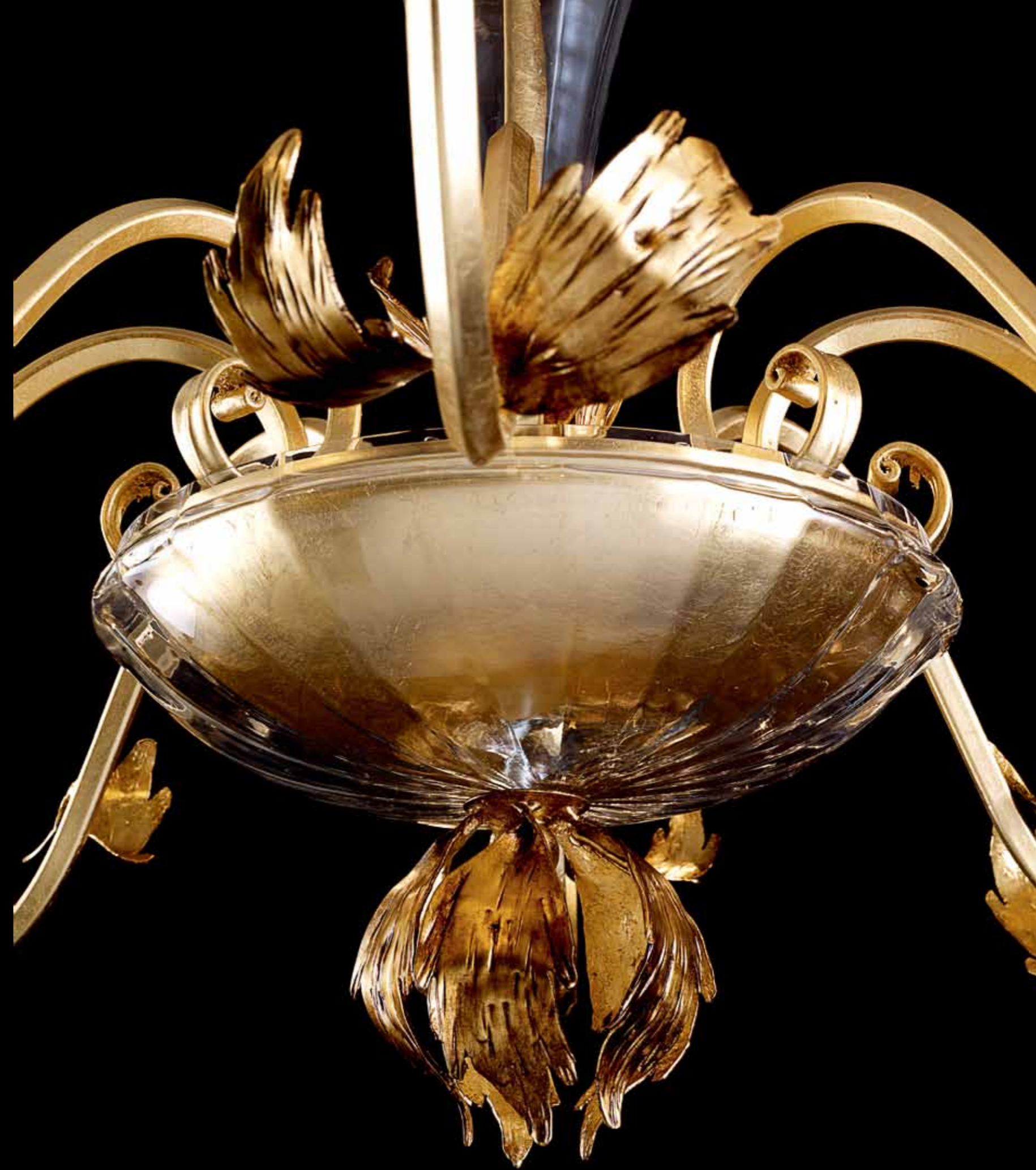
● Art. 19300/8 Diam.120 cm. - H.80 cm. 8 x E14 42W ES max