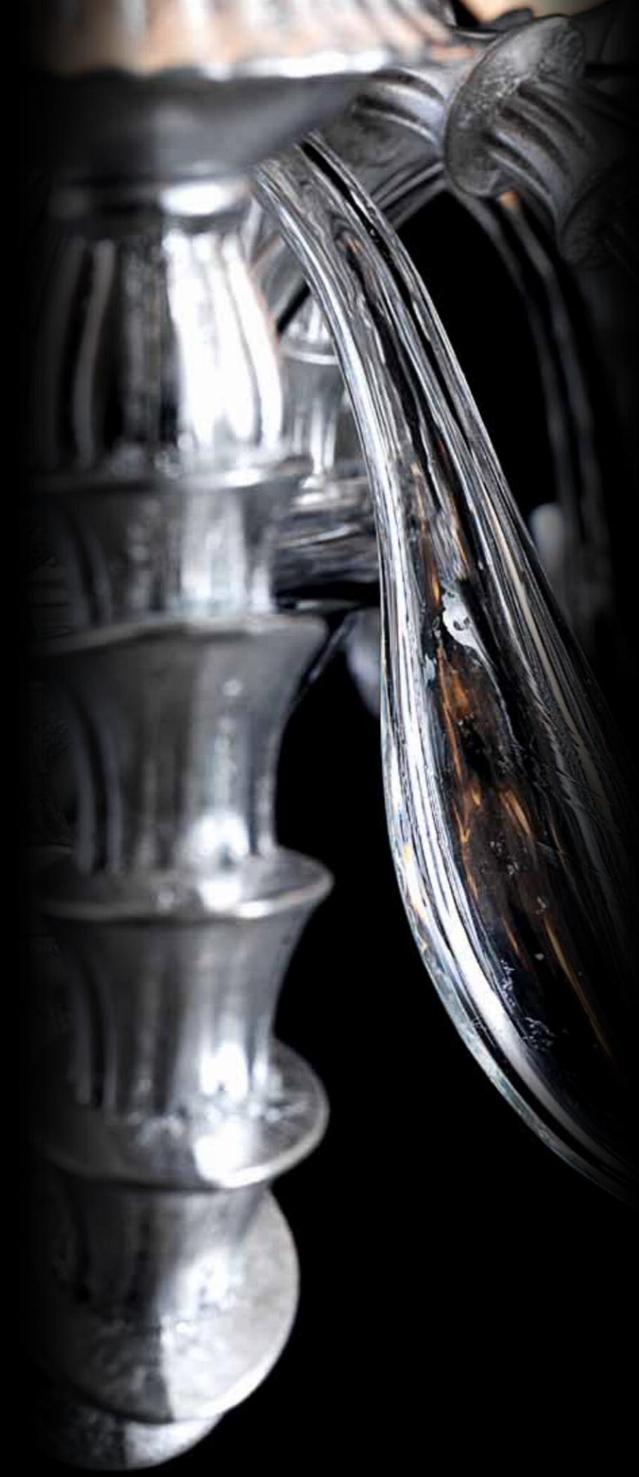
● Art. 20301/10-S Diam.95 cm. - H.60 cm. 10 x G9 33W ES max