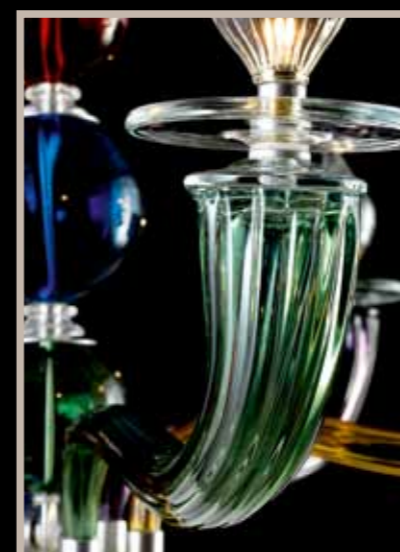
verde / green