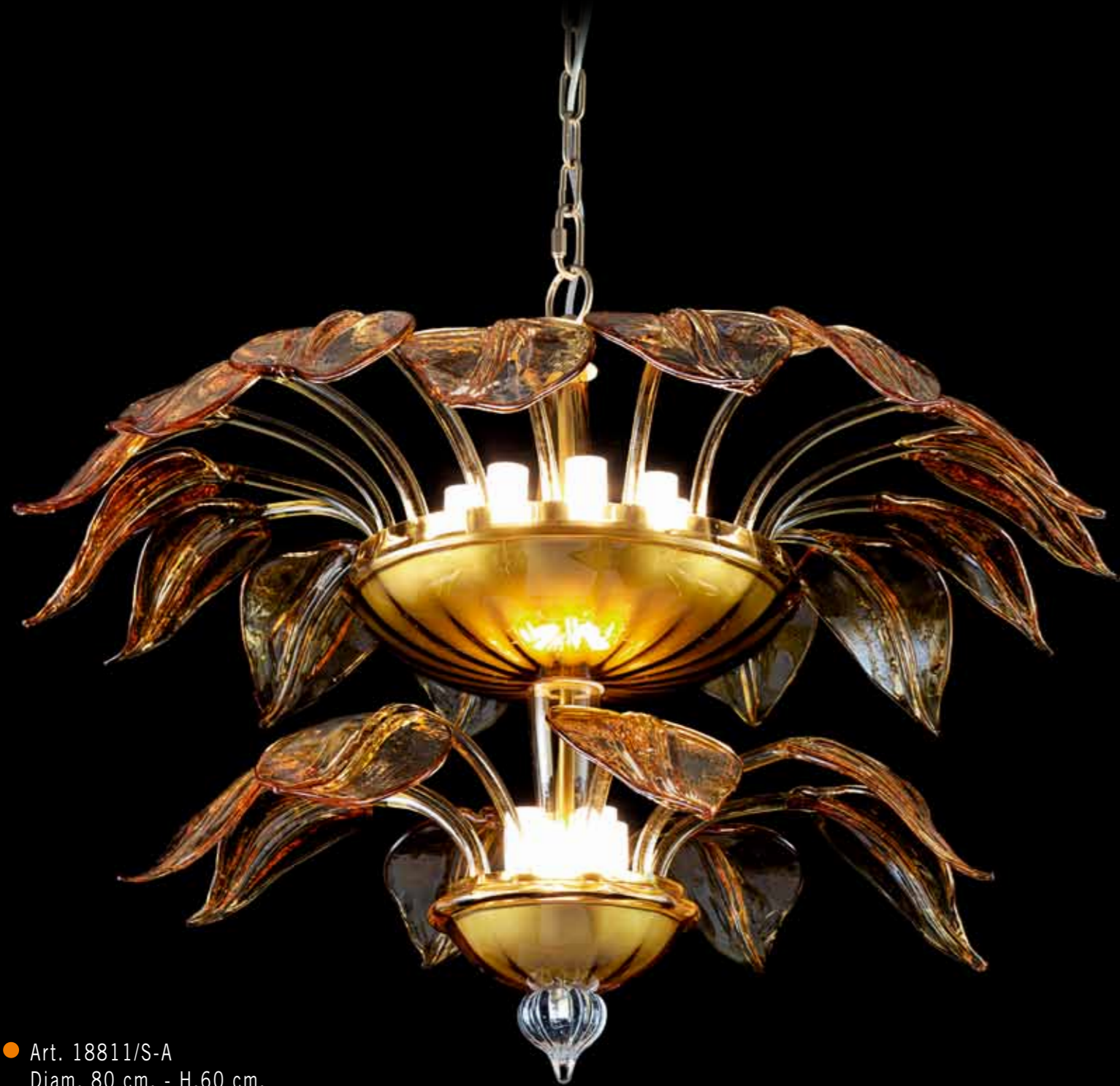
● Art. 18811/S-A Diam. 80 cm. - H.60 cm. 12xG9 33W ES max