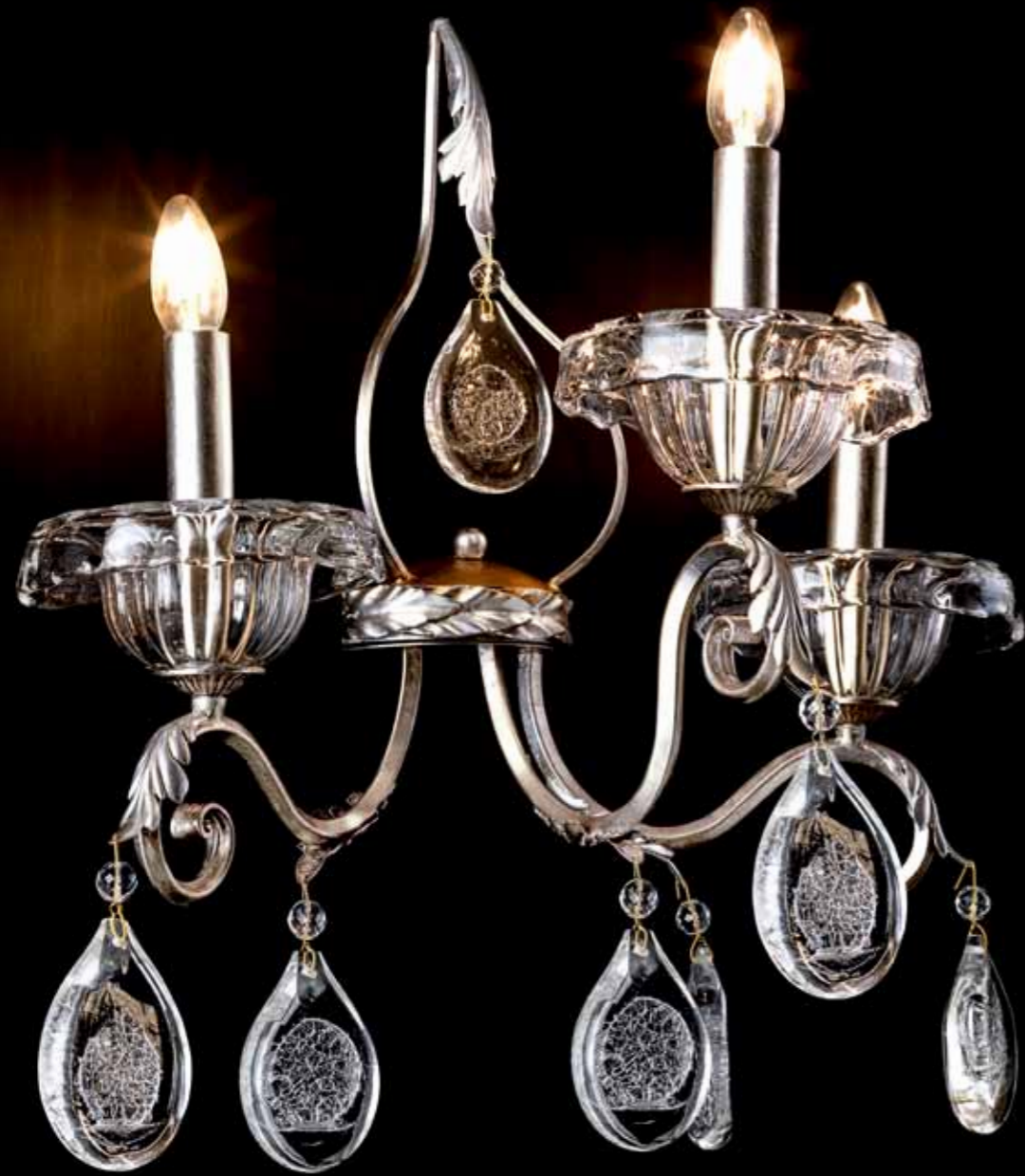
● Art. 20005/A3 Diam.55 cm. - H.60 cm. - Sp.35 cm. 3 x E14 42W ES max