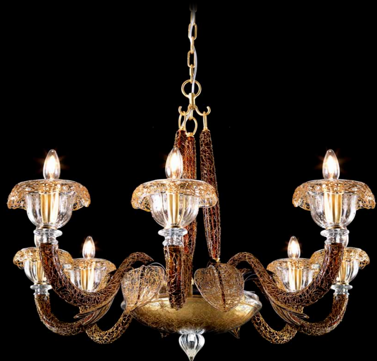
● Art. 18814/8-MTO Diam.120 cm. - H.70 cm. 8 x E14 42W ES max