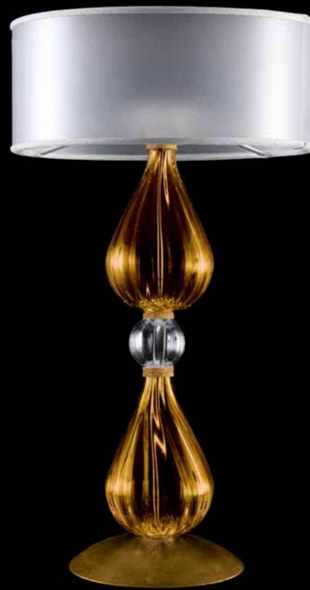
● Art. 20405/LG-A Diam. 40 cm. - H. 66 cm. 1xE27 80W ES hal. max