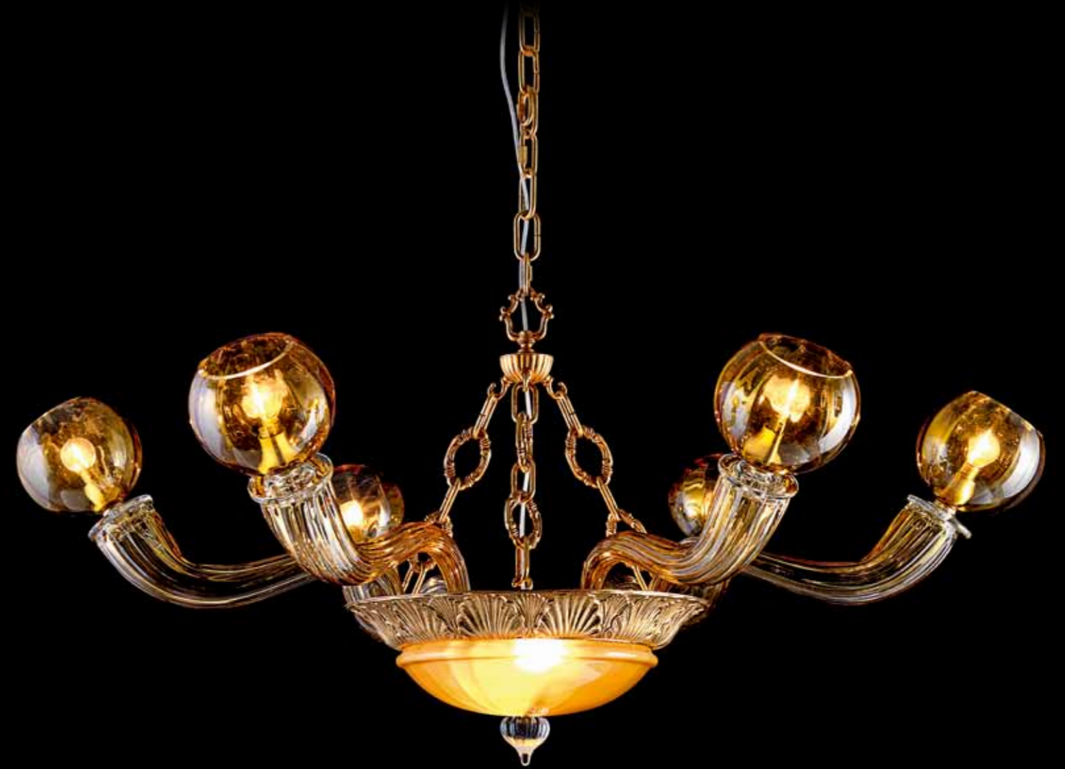
● Art. 19700/S6-A Diam.140 cm. - H.65 cm. 6 x E14 42W ES max + 2 x G9 33W ES max