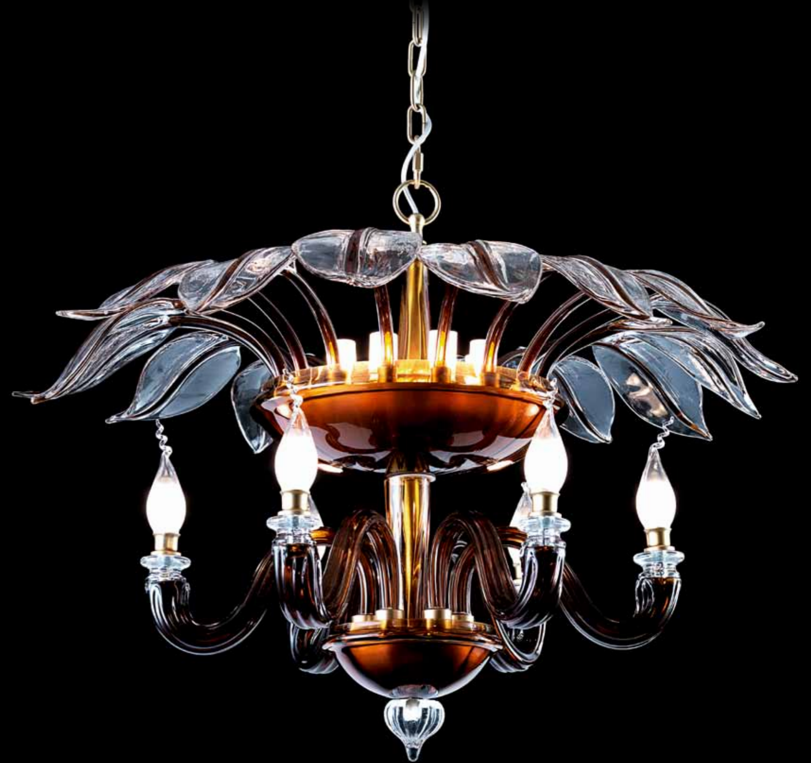
● Art. 18813/8+6-M Diam.80 cm. - H.60 cm. 14 x G9 33W ES max