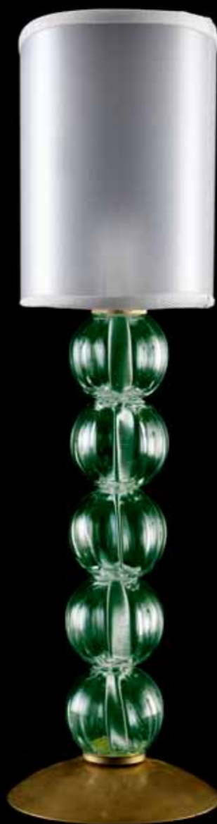
● Art. 20403/LG-G Diam. 15 cm. - H. 55 cm. 1xE27 120W ES max