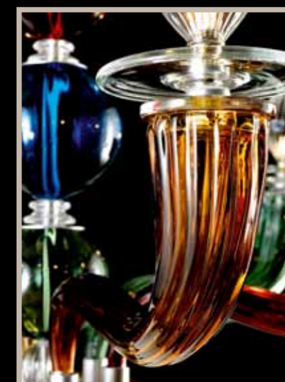
tabacco / tobacco