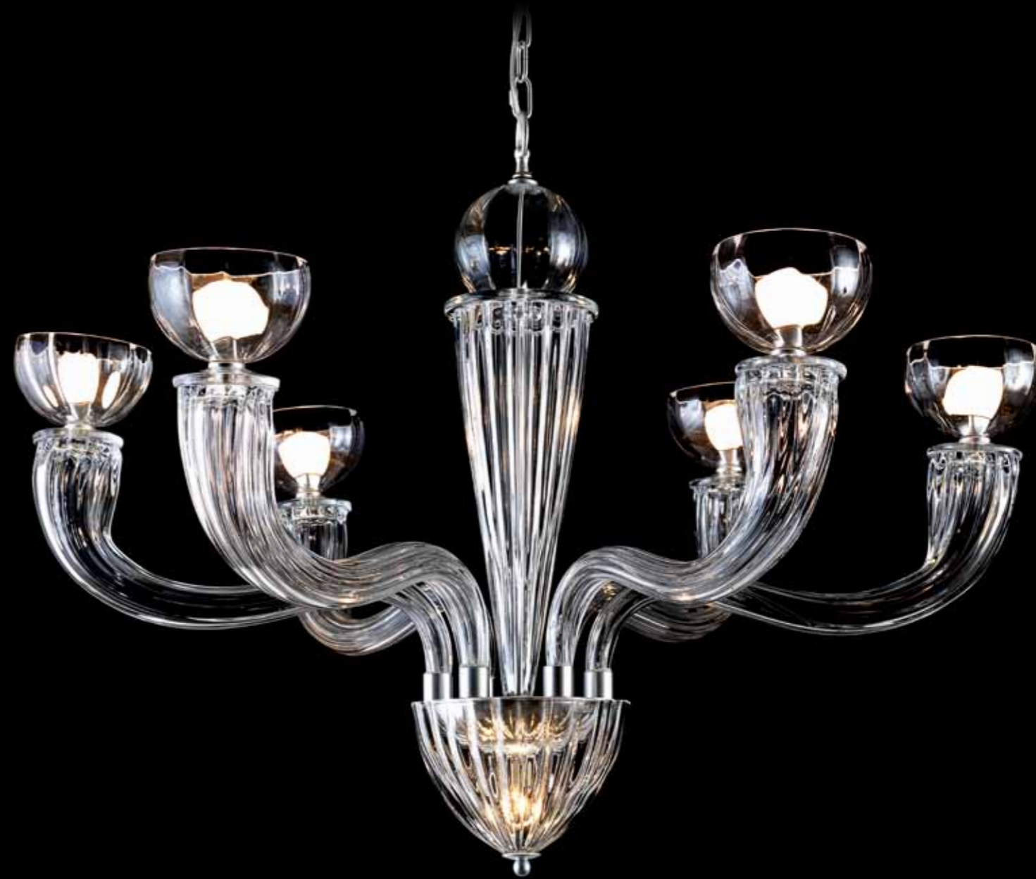
● Art. 18704/6+1-T Diam.105 cm. - H.80 cm. 7 x G9 33W ES max