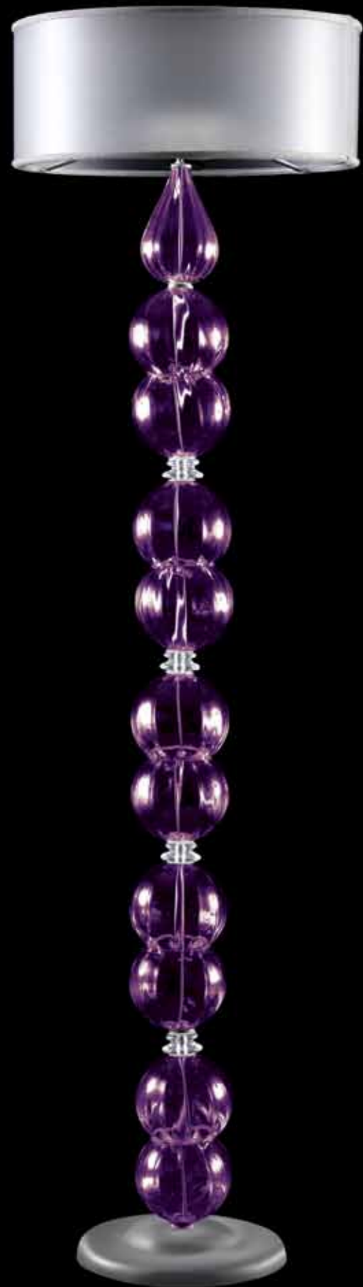
● Art. 20502/P-V Diam. 50 cm. - H. 180 cm. 1xE27 205W ES hal. max