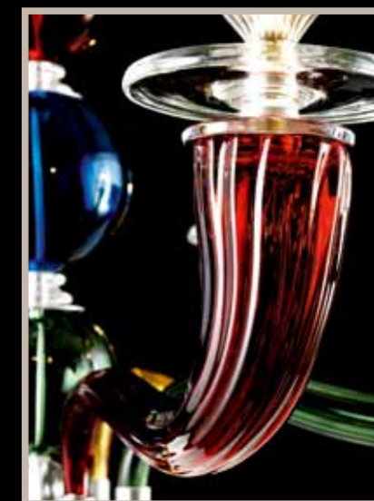
rosso / red