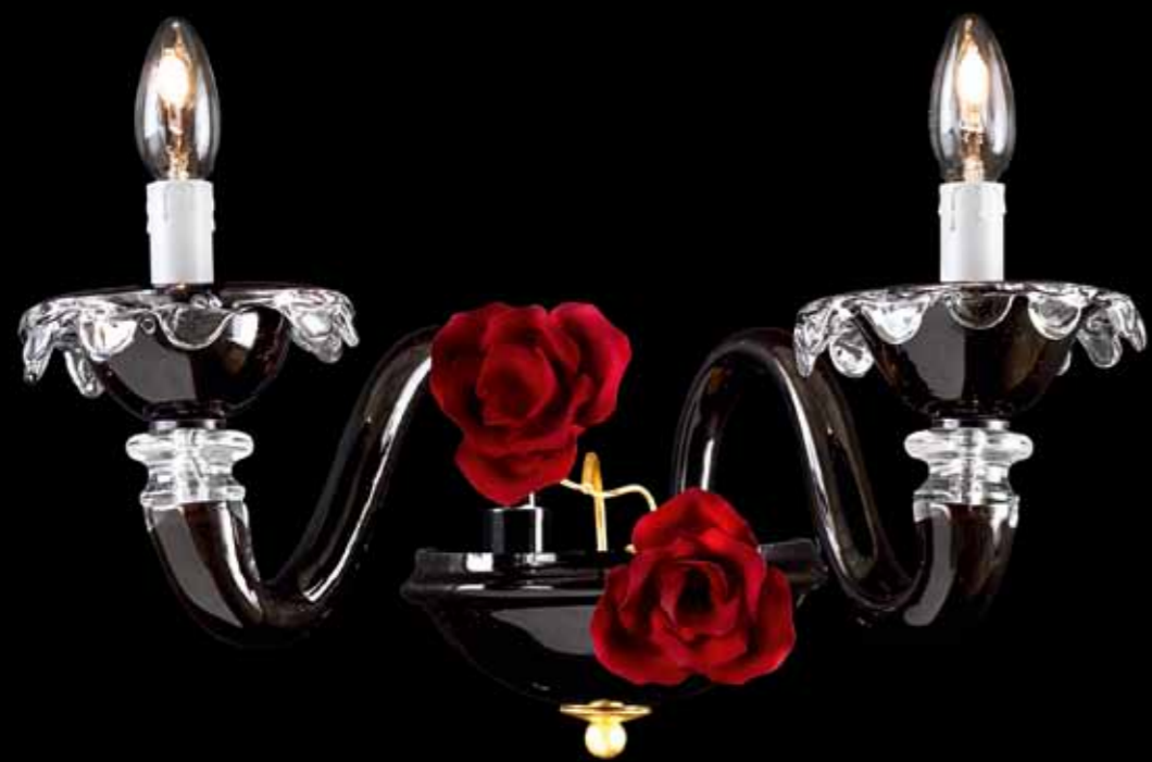
● Art. 18902/A2S-NR Diam.46 cm. - H.23 cm. - Sp.28 cm. 2 x E14 42W ES max