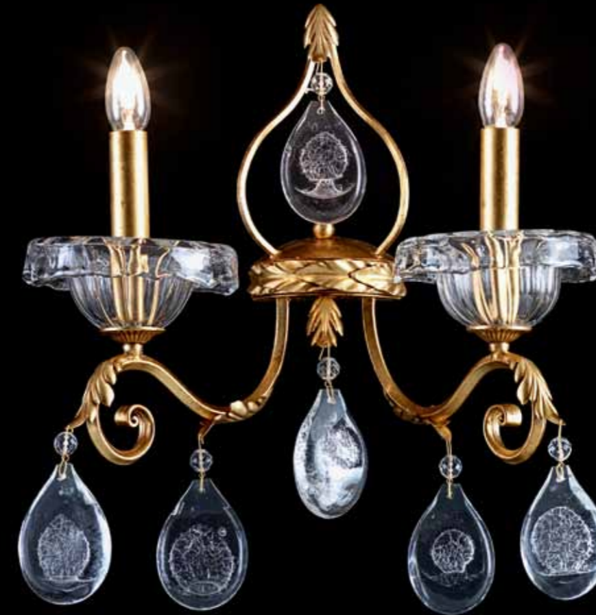
● Art. 19904/A2 Diam.45 cm. - H.50 cm. - Sp.23 cm. 2 x E14 42W ES max