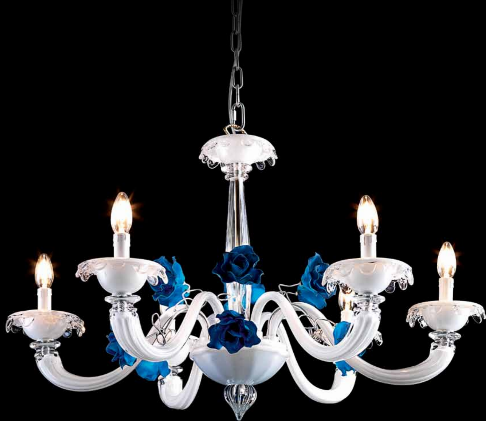
● Art. 19000/6O-WZ Diam.90 cm. - H.50 cm. 6 x E14 42W ES max